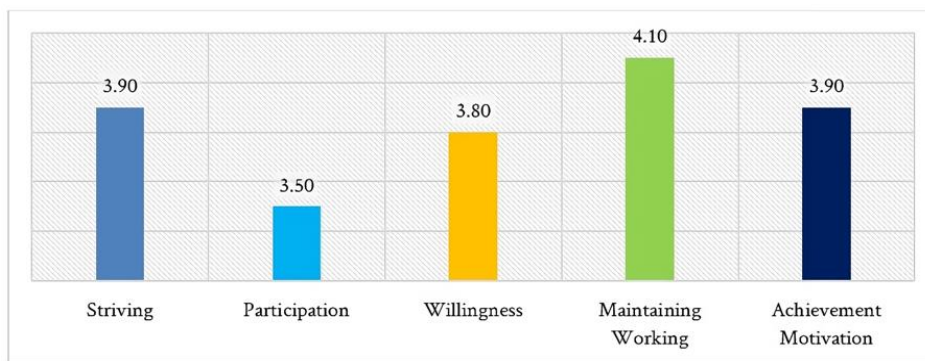
Figure 4. Means of four dimensions & overall mean for achievement motivation (Source: Field data from survey)